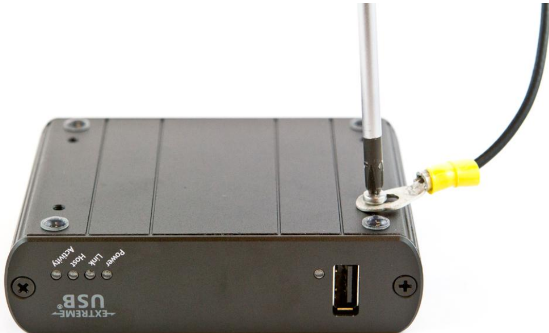
Figure 4 Attaching ground screw and wire

Step 2: Attach crimp connector to wire and place over one of the mounting holes. Insert screw and tighten.