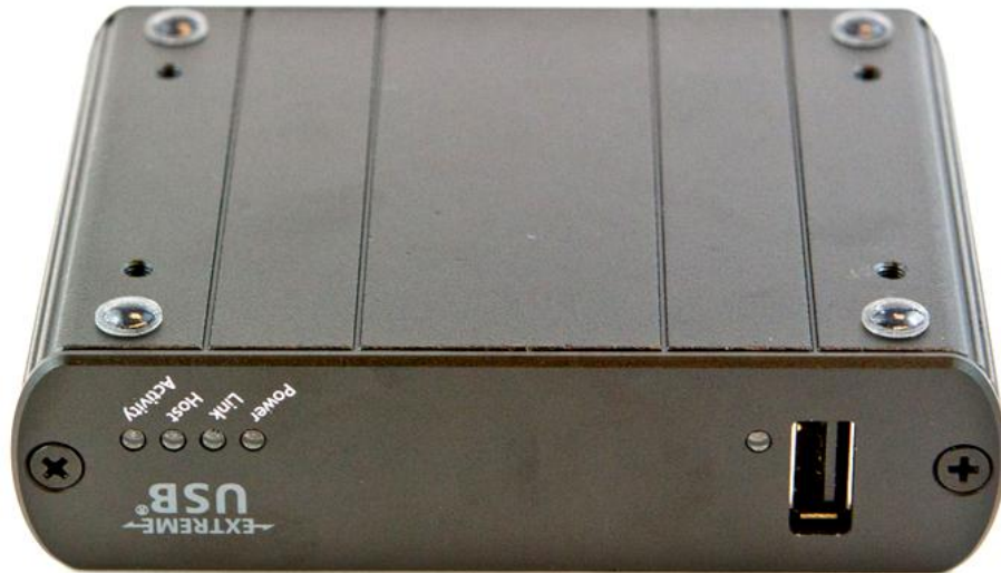
Figure 3 Local extender unit showing four mounting holes

Step 1: Turn local extender unit over to expose unit's four mounting holes.