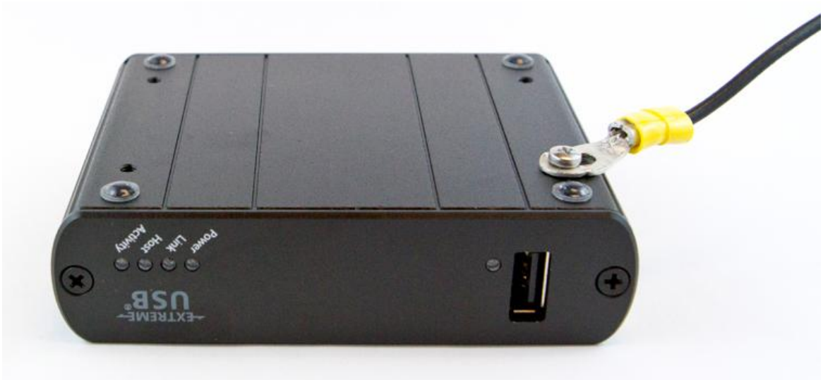
Figure 5 Ground screw connection complete

Step 3: Ensure connection is secure, and attach the other end of the wire to your ground source. Repeat these same steps for remote extender unit.