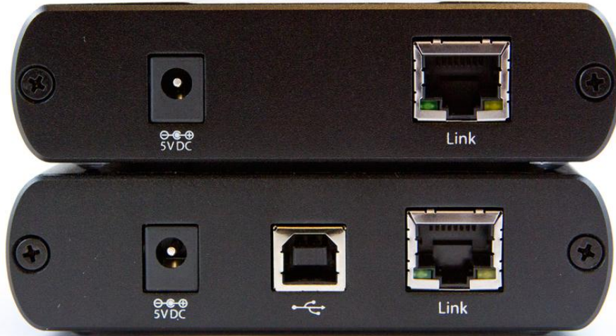
Figure 2 New faceplates

Optional grounding capability (if required) is still available by connecting a screw and grounding wire to any one of the four pre-threaded mounting holes on the bottom of the enclosures. The previous grounding process required drilling into the marker on the rear faceplate.